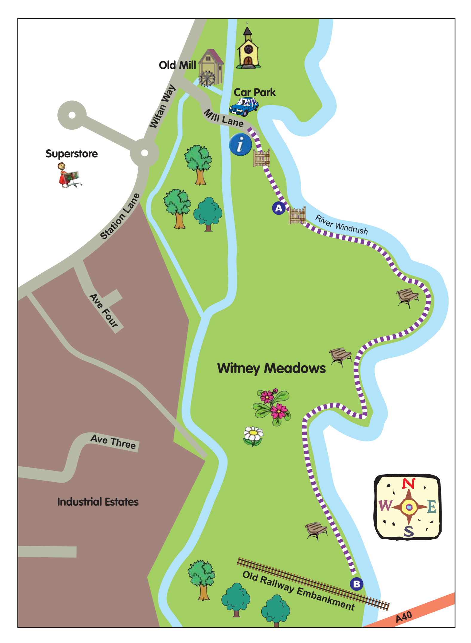
Contains Ordnance Survey data © Crown copyright and database right 2010