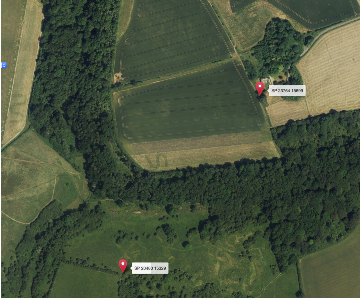
Map overview of OS Grid points