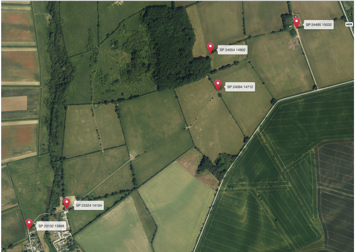
(c and d)